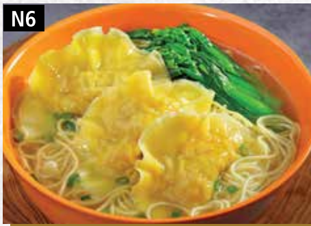
水饺面(汤) ..... $5.00 DUMPLING NOODLE (SOUP)