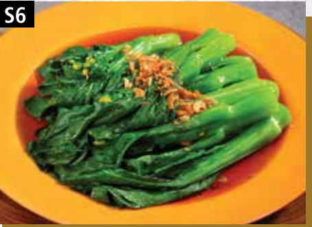
招牌油菜 ..... $6.00 SIGNATURE VEGETABLES