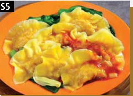
干捞水饺(7粒) ..... $7.00 DRY DUMPLING (7PCS)