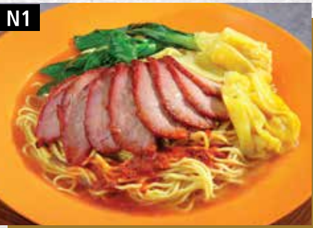
云吞面(干) ..... $5.00 WONTON NOODLE (DRY)