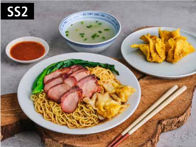
云吞面(干/汤) + 炸云吞(5粒) WONTON NOODLE (DRY/SOUP) + CRISPY FRIED WONTON (5PCS) $7.80