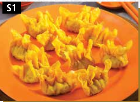
炸云吞(11粒) ..... $7.00 CRISPY FRIED WONTON (11PCS)