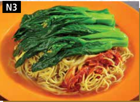
油菜面(干) ..... $5.00 VEGETABLE NOODLE (DRY)