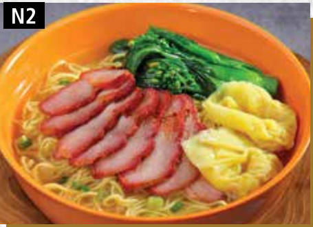
云吞面(汤) ..... $5.00 WONTON NOODLE (SOUP)