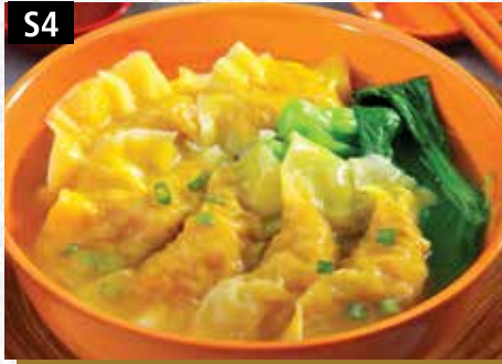
水饺汤(6粒) ..... $6.00 DUMPLING SOUP (6PCS)