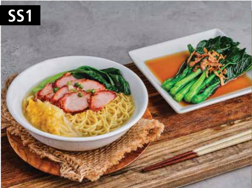
云吞面(干/汤) + 招牌油菜 WONTON NOODLE (DRY/SOUP) + SIGNATURE VEGETABLES $7.80