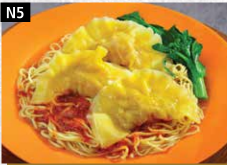
水饺面(干) ..... $5.00 DUMPLING NOODLE (DRY)