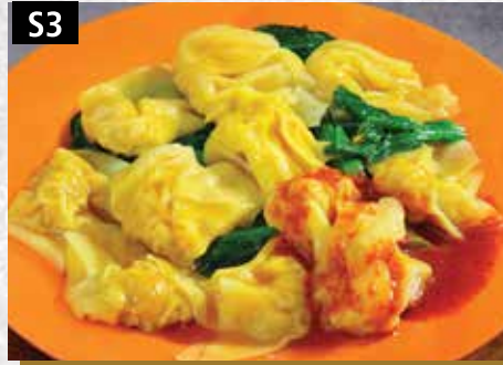
干捞云吞(11粒) ..... $7.00 DRY WONTON (11PCS)